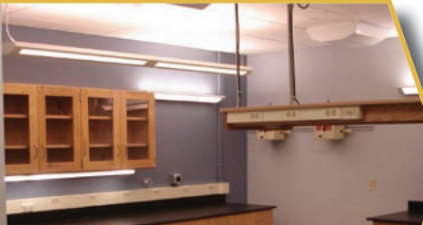
Northeastern University Driving Laboratory