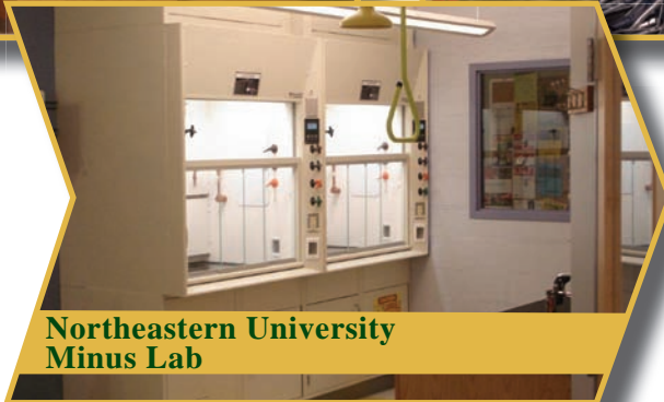
Northeastern University Minus Lab