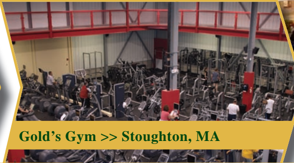
Gold's Gym » Stoughton, MA