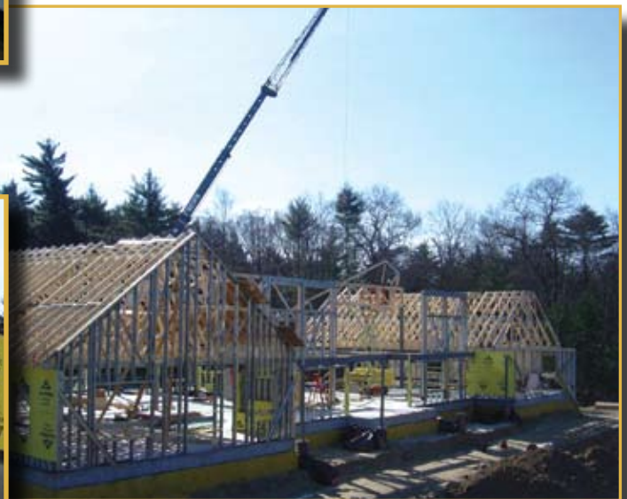
(Above & Left): Topping off!